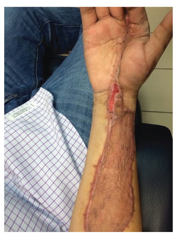
Figure 5. At 24 days, the wound has achieved closure.