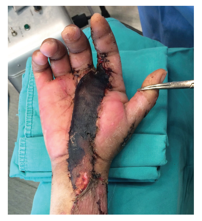
Figure 1. Radial forearm fasciocutaneous flap coverage of the palmar defect 10 cm \times 4 cm. The flap was based on a single dominant perforator at the pivot point. At 14 days, the skin paddle of the flap is necrotic.

and the patient was brought to surgery. The flap was debrided down to the adipofascial layer, which was noted to be pale with little signs of vascularity (Figure 2).