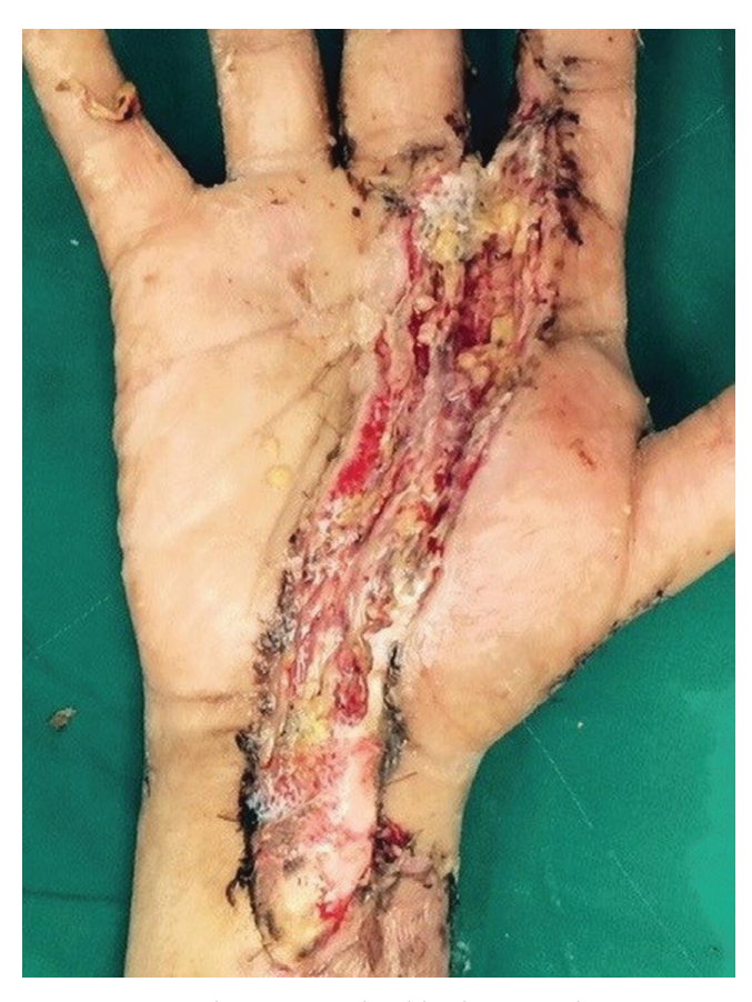
Figure 3. At 72 hours, note that bleeding vessels are more prominent throughout the flap. Also, note the change in color of the proximal dermis.

Biochemical Corporation, CLS-1, Lakewood, NJ, USA) at a concentration of 200 CDU/ml of total volume. The collagenase was injected into the canister through a sterile 0.22-micron filter (Millex-MP, Millipore, Cork, Ireland). The mixture was dissociated for 40 minutes in an incubated shaker table at 38°C and 150 RPM. After dissociation, human albumin was added to achieve a concentration of 2.5 and thereby stopping the reaction through the binding by albumin of calcium and magnesium ions essential for enzyme function. The mixture was centrifuged for 10 minutes at 800x gravity. The SVF cells concentrated at the bottom of the device, and were removed using a 6-inch needle (Abbocath-T, Hospira Ireland, Sligo, Ireland). The cells were resuspended in Ringer's lactate solution to a total of 20 cc. Ten microliters of SVF were taken from the final suspension and submitted for differential staining. Two samples were then passed through an image cytometer (ADAM-MC, Portsmouth, NH, USA) for the counting of mononucleated cells and to assess cell viability. The viable index was 184,000 cells per gram of dry fat. The total viable cell count was 6.8 \times 10^7 .