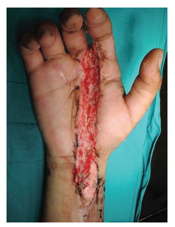
Figure 4. At 10 days, the width of the wound has diminished by 50%. Interim treatment consisted of local debridement and saline dressings.

wrist crease had softened by a considerable degree, allowing for increased wrist extension. Sensation was restored to the radial middle finger and proximal ulnar index finger but not yet to the pulp of the index. Full composite flexion has been achieved. There is a 10-degree loss of extension at the PIP level of the middle finger. The patient gained control and strength of the thumb through the tendon transfer with restoration of abduction in all planes, and opposition pulp-pulp to all fingers. The strength of the key pinch and chuck pinch continued to improve. The donor site skin graft demonstrated suppleness to pinch, with wrinkles forming with normal motion (Figure 6).