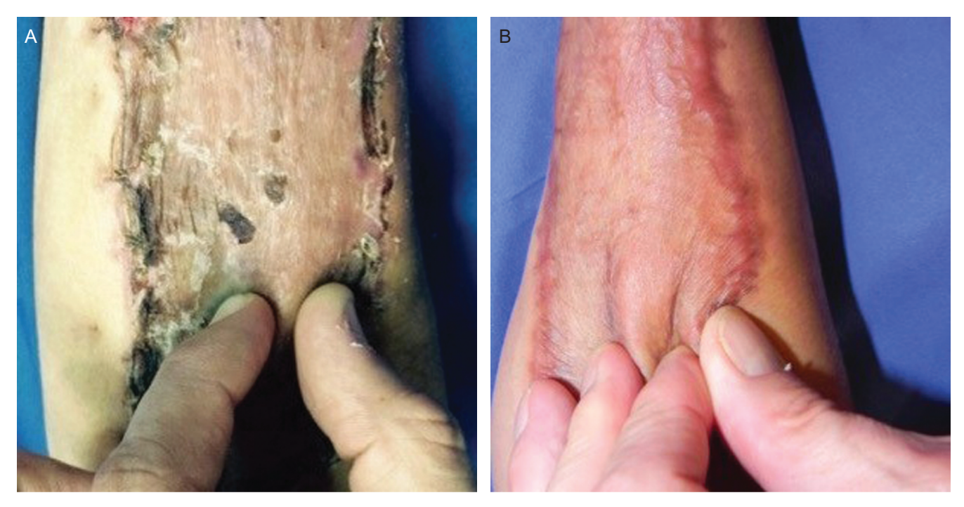
Figure 6. (A) The split thickness skin graft over volar forearm flap donor site at 2 weeks (photograph was taken immediately post-stromal vascular fraction treatment) shows typical stiffness and coloration. The proximal forearm is inferior. (B) The split thickness skin graft over the volar forearm donor site at 5 months post-stromal vascular fraction treatment shows color change, smoothness of contour, and improved flexibility. The proximal forearm is inferior.