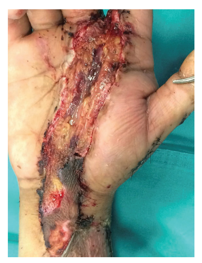
Figure 2. After debridement, the remaining adipofascial flap is pale. Despite 2 weeks of time in residence, it has been poorly vascularized from the underlying soft tissues of the hand. The flap is at this time infitrated with adipose-derived stromal vascular fraction cells.